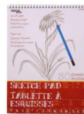
(Sketch book typically found at the $ Store)